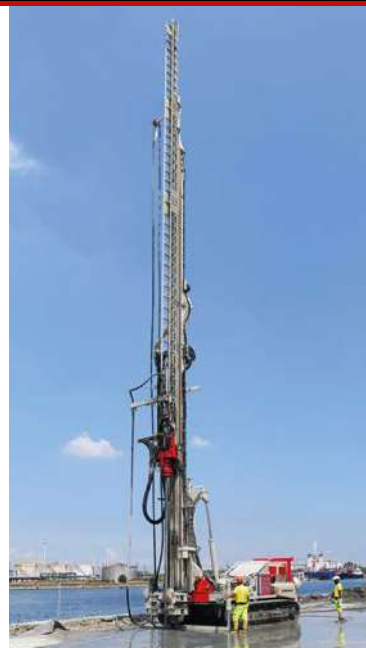
A Comacchio MC 30 rig was used to install 126 columns with a length of 16.7m at a rate of 12 columns per day

Jet grouting columns are being installed as part of the renovation of the TCR Dante dock, where RCM Costruzioni is currently operating with a Comacchio MC 30. The jet grouting treatment is the final part of the project that has involved the creation of a new combi-wall, followed by the construction of 1200mm bored piles to support the new dock structure. The consolidation with single fluid jet grouting technique involves the installation of six rows